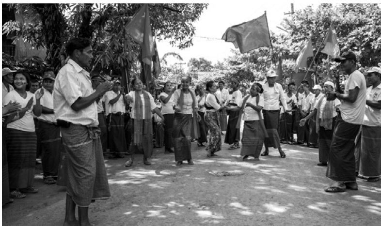
Mon National Party supporters dance during their campaign event in Mudon township, Mon state.

that their names and identities had been publicized and defamed on social media, making them fearful of reprisals. In central Rakhine state, where ethno-religious nationalism was stoked by anti-Muslim violence in 2012 and 2013, a journalist had to temporarily exile himself from the community after writing an article critical of the use of religion in politics, which prompted a campaign of intimidation led by local monks. 75 These cases are symptomatic of wider sensitivities around religious identity.