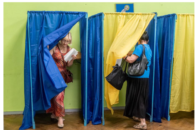
Although curtains help keep the secrecy of the vote in Ukraine, they should be avoided during the COVID-19 crisis to reduce the chance of virus transmission.

The layout inside each polling station also must be carefully planned. The placement of the tables and the seats for poll workers should respect the required physical distance, and officials should control the flow of voters at each stage of the polling process to avoid person-to-person contact and allow time for sanitization of any equipment. EMBs should also consider eliminating any steps that might lead to unnecessary touching of objects. For instance, EMBs might prefer buildings with fewer doors or doors that open and close automatically to avoid handling of doorknobs and using fixed booths rather than curtains to avoid voters touching the cloth. Multiple-person seating, especially benches and side-by-side chairs, should be removed, and the polling place should have as few unnecessary objects and surfaces