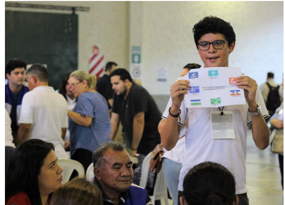
During the vote count, poll workers should show each ballot to observers and party agents from a distance.

In many countries, the core part of the election results process starts in the polling stations with the hand count of paper ballots by poll workers. Thereafter, the results sheets from individual polling stations are aggregated, often at the constituency level, and results announced by the returning officer. Other countries use direct-recording electronic voting machines in the polling stations that automatically calculate the numbers of votes and transmit the results to a central location for verification and aggregation. In some instances, voters mark their preference on paper ballots that are then scanned and processed.