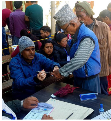
Indelible ink can be applied by the poll workers or by voters directly. Applicators that reduce the need for human-to-human contact should be preferred.

pens after every voter, which is a more time-consuming task. Hand sanitization before the procedures is still recommended to avoid contaminating the voter register itself. Voter should also allow their hands to completely dry to avoid damaging the paper.