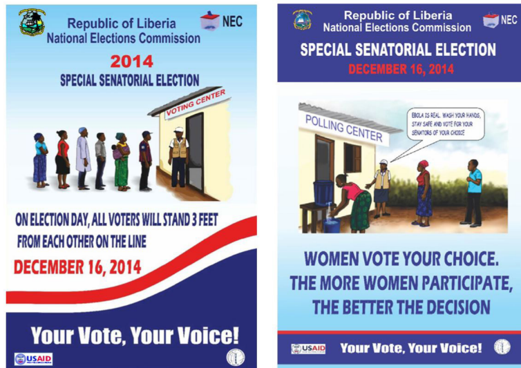
Examples of voter education materials from Liberia during the 2014 Ebola outbreak.

EMBs should also tackle disinformation campaigns and hate speech against marginalized groups via voter education.