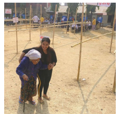
A woman receives assistance to vote in Nepal. Physical distance requirements cannot always be followed during assisted voting and PPE is recommended

Toilet or restroom facilities present unique challenges during mass gatherings, as it is difficult to control behavior in secluded places and they are the area where an exchange of bodily fluids would most likely occur. Individuals who are feeling unwell are also likely to seek out this place when coughing. To allow for easier, more accessible handwashing and avoid gatherings inside restrooms, handwashing or hand-sanitizing stations with soap and water or alcohol-based solutions should be placed outside all toilet facilities and follow accessibility requirements. Depending on cultural expectations, these stations can be separated by gender to avoid intimidation of women voters. Where